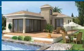
Good news for UK home owners

British citizens who buy a home abroad will not face an income tax charge if they purchase the home using a company as the owner, it was recently announced. Under the new rules, British nationals will be free to set up a company to own their holiday home and will not be liable for the 'benefit in kind charge' if they do so.