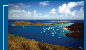
British Virgin Islands

The British Virgin Islands Financial Services Commission recently announced that it has amended the schedules to the BVI Business Companies Act (BVIBCA). Specifically, the Commission reduced the 2007 annual fees payable by companies registered under the Companies Act to 2006 levels and also established new, simplified provisions for the transitioning of bearer share companies to companies with registered shares. At the same time, it raised the incorporation and annual fees that will be payable by private trust companies from $350 to $750 for companies authorised to issue less than 50,000 shares and from $1,200 to $1,450 for companies with more than 50,000 shares.