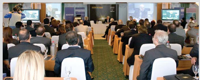
Conference delegates came from Cyprus and all over Europe.

For a full report and more pictures from the conference, please visit our Recent News section on our web site at www.totalservicey.com .