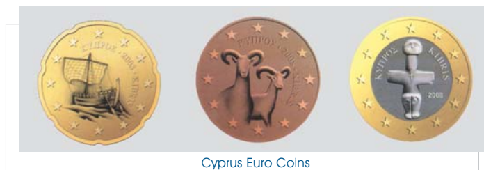
Cyprus Euro Coins

Eurozone average in 2007-2011, with robust domestic demand growth driven by rising incomes, low interest rates and an increase in infrastructure spending. Since Cyprus companies enjoy